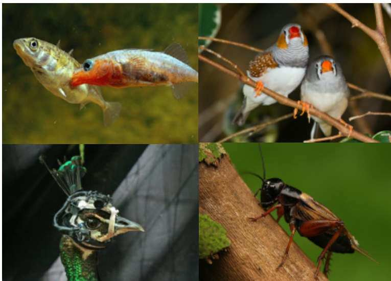
Figure 1. (A) Threespine stickleback Gasterosteus aculeatus, (B) Zebra finch Taeniopygia guttata, (C) Indian peafowl Pavo cristatus, (D) Two-spotted cricket Gryllus bimaculatus.

Kastarakos and Hedwig [8] showed that the strength of the phonotactic response of female Gryllus bimaculatus crickets to variation in male chirp pulse duration varies continuously (Figure 1D). When exposed to the same set of stimuli, activity patterns of one neuron matched the graded female phonotaxis behavior, demonstrating a cognitively encoded ranking of options (preference) that corresponded to female decisions.